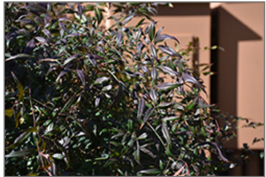
Plum Passion Nandina foliage