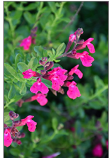
Mirage Hot Pink Autumn Sage flowers

Mirage Hot Pink Autumn Sage is an herbaceous evergreen perennial with an upright spreading habit of growth. Its medium texture blends into the garden, but can always be balanced by a couple of finer or coarser plants for an effective composition.