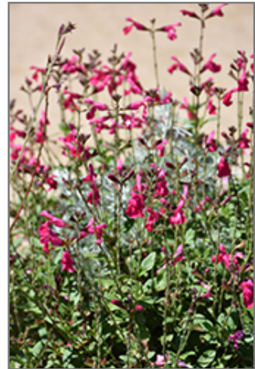
Mirage Hot Pink Autumn Sage flowers

Mirage Hot Pink Autumn Sage is a fine choice for the garden, but it is also a good selection for planting in outdoor pots and containers. It is often used as a 'filler' in the 'spiller-thriller-filler' container combination, providing a mass of flowers against which the larger thriller plants stand out. Note that when growing plants in outdoor containers and baskets, they may require more frequent waterings than they would in the yard or garden.