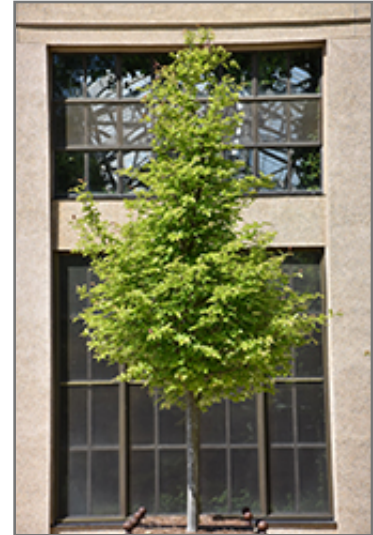
Persian Parrotia