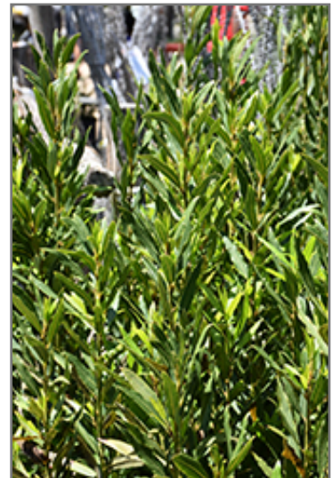
Emerald Wave Sweet Bay foliage