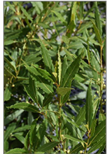
Emerald Wave Sweet Bay foliage

When grown indoors, Emerald Wave Sweet Bay can be expected to grow to be about 8 feet tall at maturity, with a spread of 4 feet. It grows at a slow rate, and under ideal conditions can be expected to live for approximately 60 years. This houseplant will do well in a location that gets either direct or indirect sunlight, although it will usually require a more brightly-lit environment than what artificial indoor lighting alone can provide. It does best in average to evenly moist soil, but will not tolerate standing water. The surface of the soil shouldn't be allowed to dry out completely, and so you should expect to water this plant once and possibly even twice each week. Be aware that your particular watering schedule may vary depending on its location in the room, the pot size, plant size and other conditions; if in doubt, ask one of our experts in the store for advice. It is not particular as to soil type or pH; an average potting soil should work just fine.