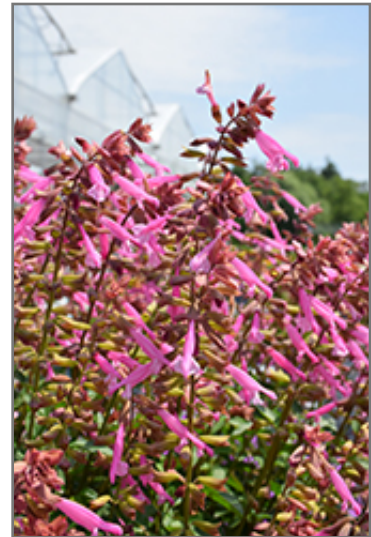
Skyscraper Pink Salvia flowers

Skyscraper Pink Salvia is an herbaceous perennial with an upright spreading habit of growth. Its relatively fine texture sets it apart from other garden plants with less refined foliage.