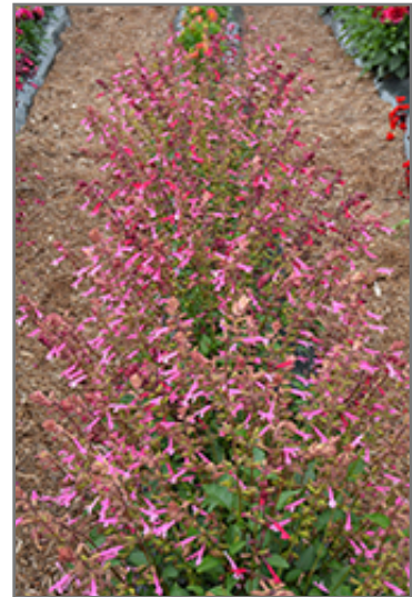
Skyscraper Pink Salvia in bloom

Skyscraper Pink Salvia is a fine choice for the garden, but it is also a good selection for planting in outdoor pots and containers. With its upright habit of growth, it is best suited for use as a 'thriller' in the 'spiller-thriller-filler' container combination; plant it near the center of the pot, surrounded by smaller plants and those that spill over the edges. Note that when growing plants in outdoor containers and baskets, they may require more frequent waterings than they would in the yard or garden.