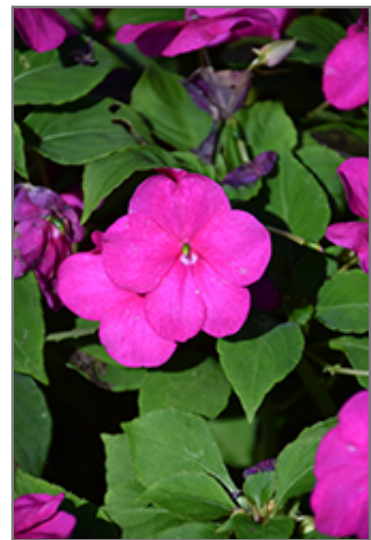
Beacon Violet Shades Impatiens flowers