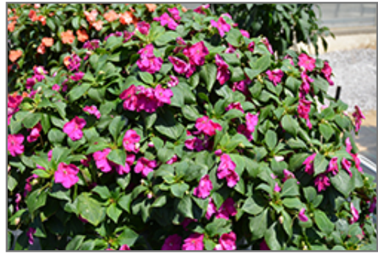
Beacon Violet Shades Impatiens in bloom

Beacon Violet Shades Impatiens will grow to be about 15 inches tall at maturity, with a spread of 12 inches. When grown in masses or used as a bedding plant, individual plants should be spaced approximately 8 inches apart. Its foliage tends to remain dense right to the ground, not requiring facer plants in front. This fast-growing annual will normally live for one full growing season, needing replacement the following year.