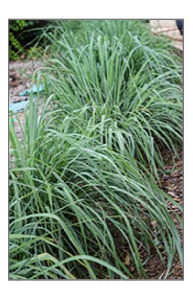
Lemon Grass

Aside from its primary use as an edible, Lemon Grass is sutiable for the following landscape applications;