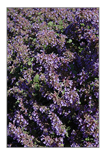
Walker's Low Catmint flowers

Bandera Location 8516 Bandera Road San Antonio, TX 78250 (210) 680-2394