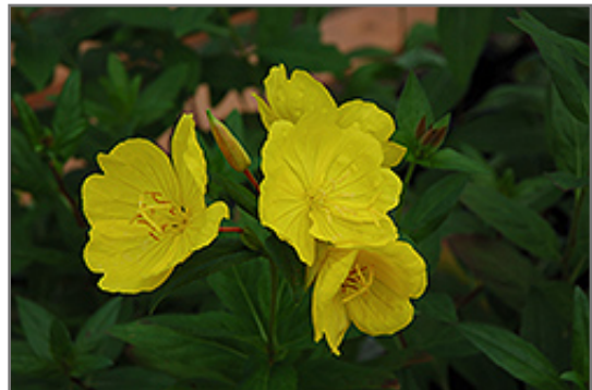
Yellow Sundrops flowers