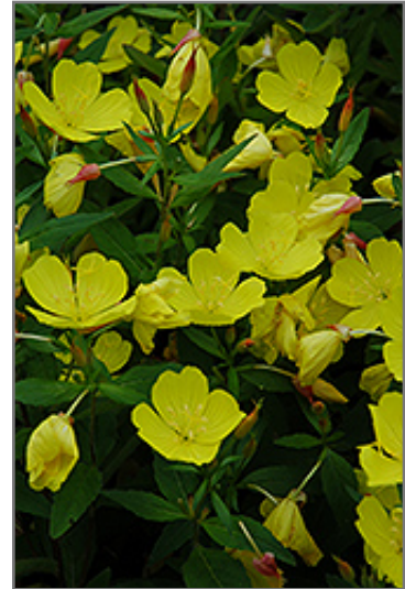
Yellow Sundrops flowers