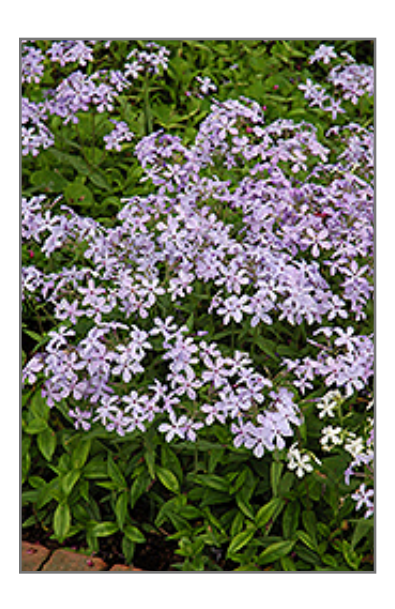
Woodland Phlox flowers

Woodland Phlox will grow to be about 8 inches tall at maturity, with a spread of 18 inches. When grown in masses or used as a bedding plant, individual plants should be spaced approximately 16 inches apart. Its foliage tends to remain low and dense right to the ground. It grows at a medium rate, and under ideal conditions can be expected to live for approximately 10 years. As an herbaceous perennial, this plant will usually die back to the crown each winter, and will regrow from the base each spring. Be careful not to disturb the crown in late winter when it may not be readily seen!