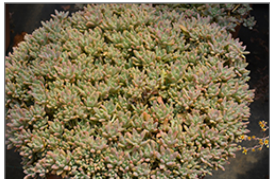
Darley Sunshine Graptosedum