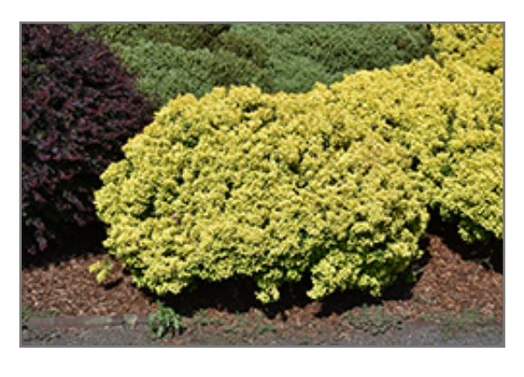
Golden Nugget Japanese Barberry

Golden Nugget Japanese Barberry is recommended for the following landscape applications;