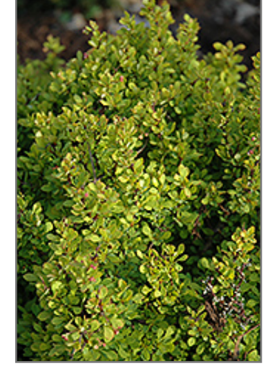
Golden Nugget Japanese Barberry foliage