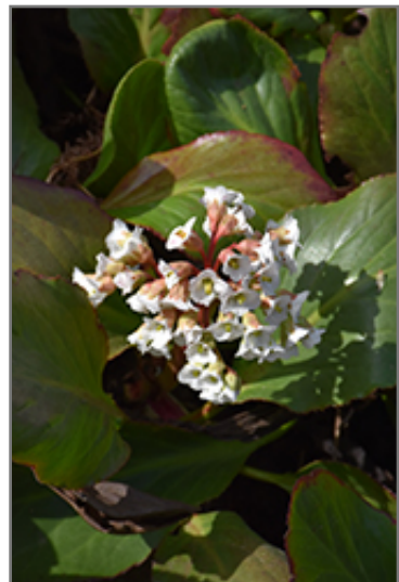
Bressingham White Bergenia flowers