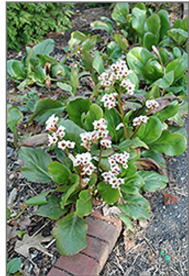
Bressingham White Bergenia in bloom