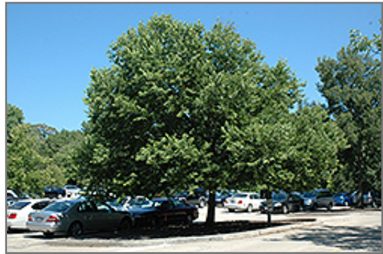
Chicagoland Hackberry

Height: 50 feet Spread: 40 feet Sunlight: ○ Hardiness Zone: 3b