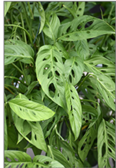
Monster Mash Adansonii Swiss Cheese Vine foliage

This variety presents large, glossy green leaves with eye-catching deep splits and holes; can be allowed to trail from a hanging basket, or grow up a support such as a trellis or moss pole; a stunning container plant for indoor spaces