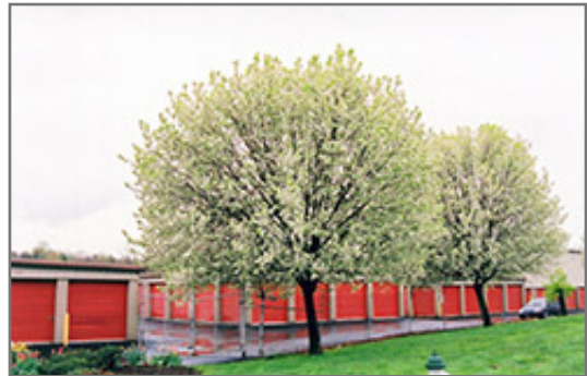
Bradford Ornamental Pear in bloom

Bradford Ornamental Pear is recommended for the following landscape applications;