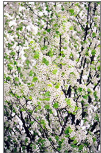
Bradford Ornamental Pear flowers