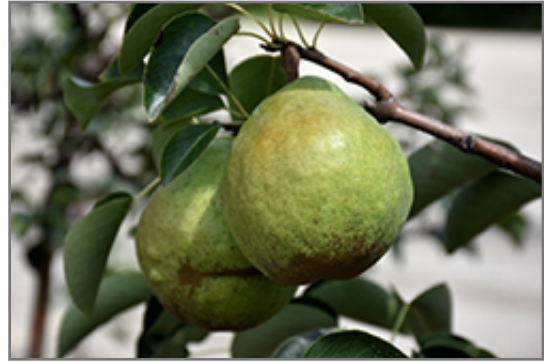
Bartlett Pear fruit