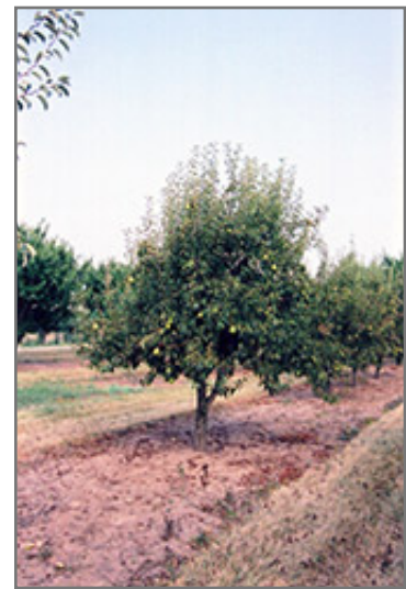
Bartlett Pear