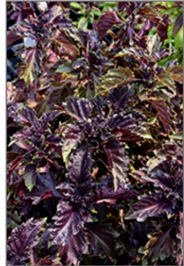
Purple Ruffles Basil foliage

This plant is quite ornamental as well as edible, and is as much at home in a landscape or flower garden as it is in a designated herb garden. It should only be grown in full sunlight. It prefers to grow in average to moist conditions, and shouldn't be allowed to dry out. It may require supplemental watering during periods of drought or extended heat. It is not particular as to soil type or pH. It is somewhat tolerant of urban pollution. This is a selected variety of a species not originally from North America.