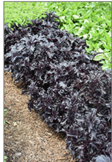
Purple Ruffles Basil