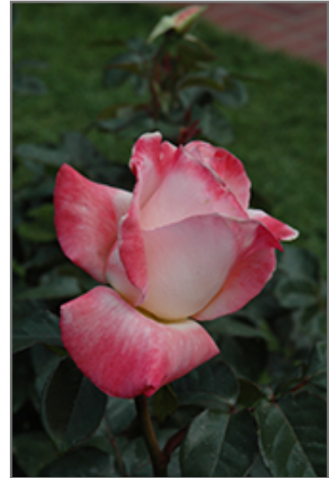
Gemini Rose flowers