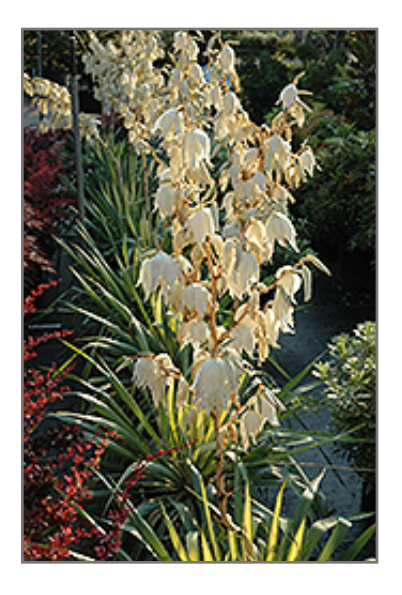
Color Guard Adam's Needle in bloom

Bandera Location 8516 Bandera Road San Antonio, TX 78250 (210) 680-2394