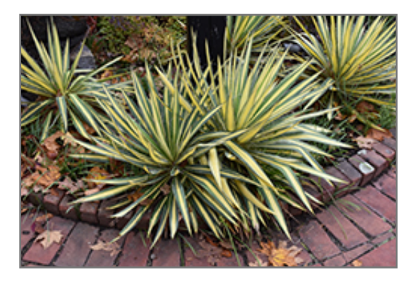
Color Guard Adam's Needle

Color Guard Adam's Needle is recommended for the following landscape applications;