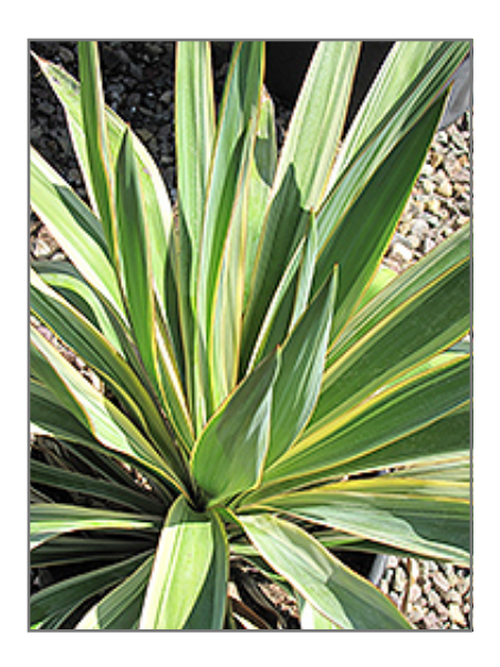
Color Guard Adam's Needle

This shrub should only be grown in full sunlight. It prefers dry to average moisture levels with very well-drained soil, and will often die in standing water. It is considered to be drought-tolerant, and thus makes an ideal choice for a low-water garden or xeriscape application. It is not particular as to soil type or pH. It is somewhat tolerant of urban pollution. This is a selection of a native North American species.