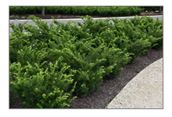
Densiformis Yew

Densiformis Yew is a dense multi-stemmed evergreen shrub with an upright spreading habit of growth. Its relatively fine texture sets it apart from other landscape plants with less refined foliage.