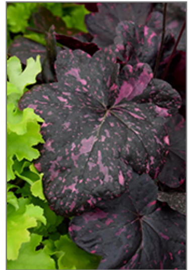
Midnight Rose Coral Bells foliage

Midnight Rose Coral Bells is recommended for the following landscape applications;