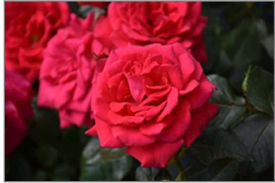
Super Hero Rose flowers

Super Hero Rose is recommended for the following landscape applications;