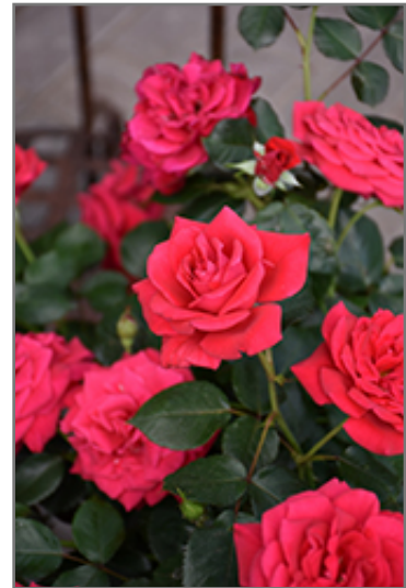
Super Hero Rose flowers