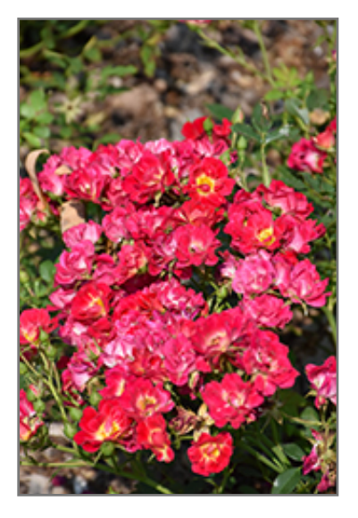
Pink Drift Rose flowers

Pink Drift Rose is recommended for the following landscape applications;