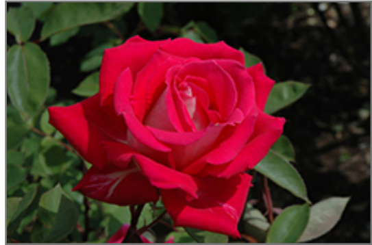
Love Rose flowers

Love Rose is recommended for the following landscape applications;