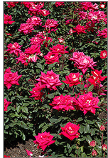
Love Rose flowers