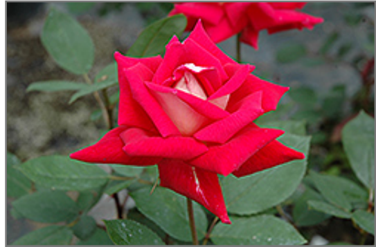
Love Rose flowers

This shrub should only be grown in full sunlight. It does best in average to evenly moist conditions, but will not tolerate standing water. It may require supplemental watering during periods of drought or extended heat. It is not particular as to soil type or pH. It is somewhat tolerant of urban pollution. This particular variety is an interspecific hybrid.