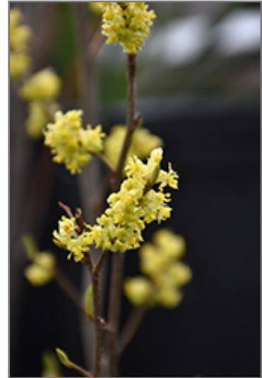
Spicebush flowers

Spicebush is recommended for the following landscape applications;