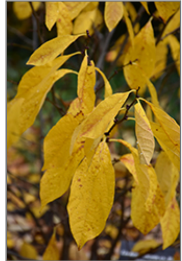
Spicebush in fall

This shrub performs well in both full sun and full shade. It prefers to grow in average to moist conditions, and shouldn't be allowed to dry out. It may require supplemental watering during periods of drought or extended heat. It is not particular as to soil pH, but grows best in rich soils. It is somewhat tolerant of urban pollution. Consider applying a thick mulch around the root zone in winter to protect it in exposed locations or colder microclimates. This species is native to parts of North America.