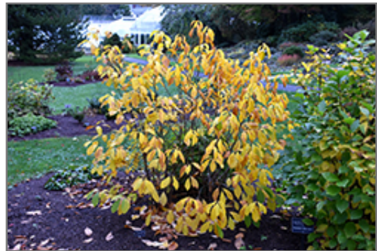
Spicebush in fall