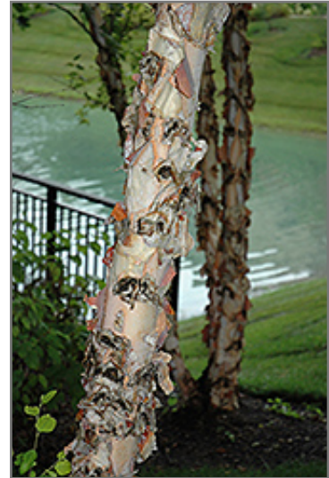
River Birch bark