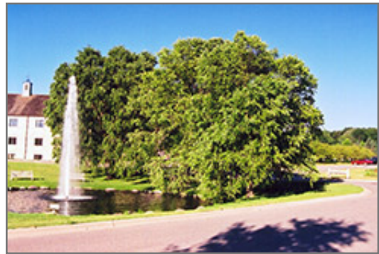
River Birch