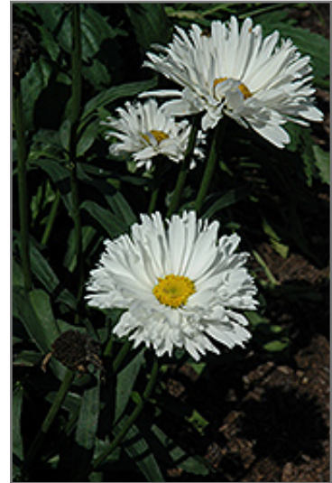
Crazy Daisy Shasta Daisy flowers

Crazy Daisy Shasta Daisy is recommended for the following landscape applications;