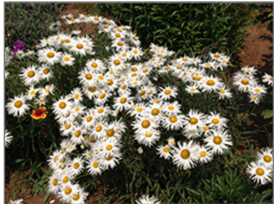
Crazy Daisy Shasta Daisy in bloom

Bandera Location 8516 Bandera Road San Antonio, TX 78250 (210) 680-2394