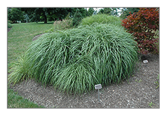
Adagio Maiden Grass foliage

Bandera Location 8516 Bandera Road San Antonio, TX 78250 (210) 680-2394