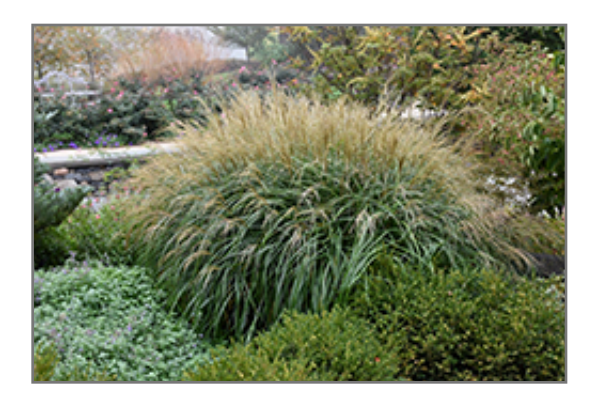
Adagio Maiden Grass flowers