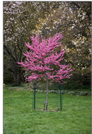
Appalachian Red Redbud in bloom

Bandera Location 8516 Bandera Road San Antonio, TX 78250 (210) 680-2394