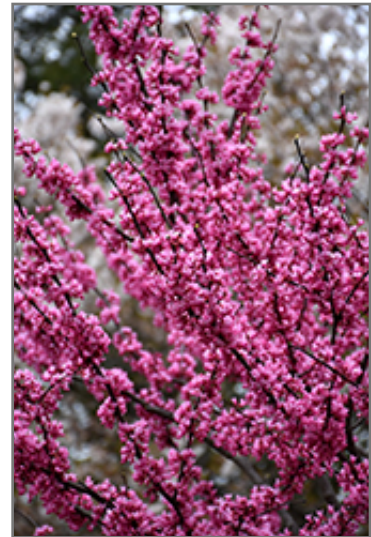
Appalachian Red Redbud flowers