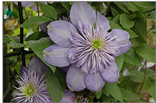
Blue Light Clematis flowers

Bandera Location 8516 Bandera Road San Antonio, TX 78250 (210) 680-2394