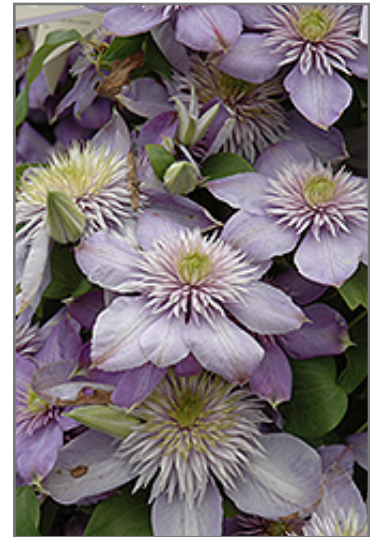
Blue Light Clematis flowers

This is a relatively low maintenance woody vine. It is a Type 2 clematis, which means it will bloom primarily on old wood of the previous season, with a second flush later in summer. Dead and weak vines should be removed in late winter, and remaining vines should be trimmed back to the first buds that are seen to remove dead stems. It is a good choice for attracting bees and hummingbirds to your yard. It has no significant negative characteristics.