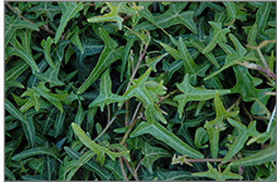
Needlepoint Perfection Ivy