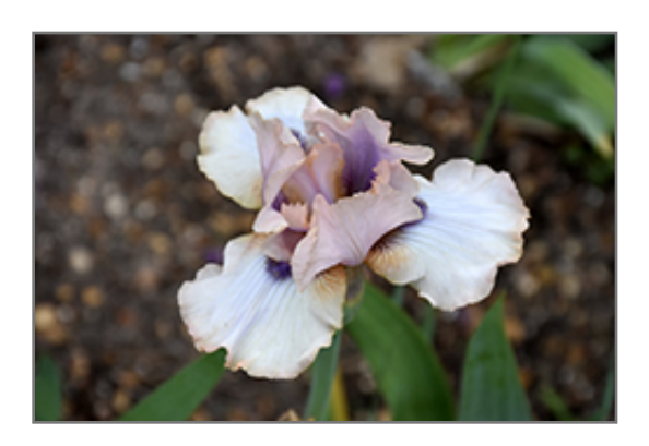
Concertina Iris flowers