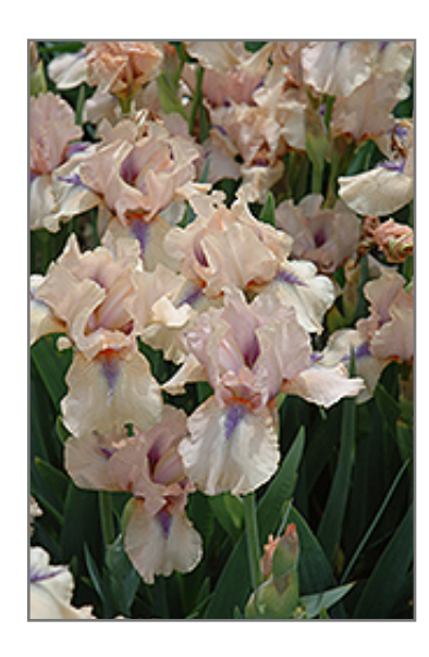
Concertina Iris flowers