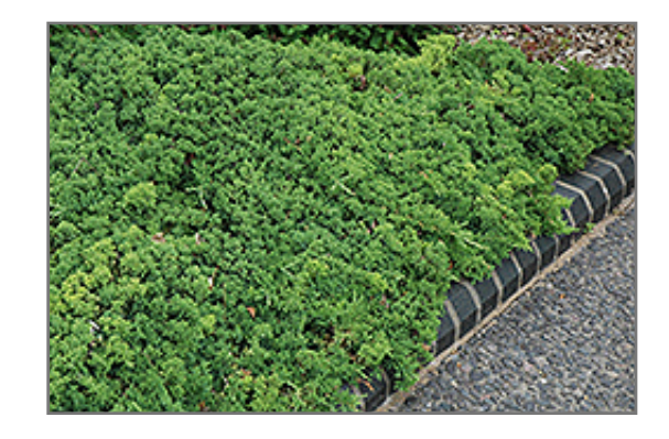
Green Mound Dwarf Japanese Juniper

This is a relatively low maintenance shrub, and is best pruned in late winter once the threat of extreme cold has passed. Deer don't particularly care for this plant and will usually leave it alone in favor of tastier treats. It has no significant negative characteristics.