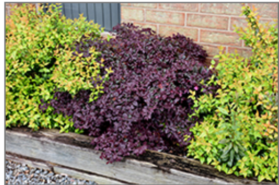
Purple Pixie Fringeflower

Bandera Location 8516 Bandera Road San Antonio, TX 78250 (210) 680-2394