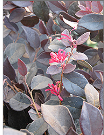
Purple Pixie Fringeflower flowers