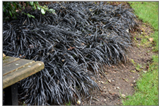
Black Mondo Grass

Black Mondo Grass is recommended for the following landscape applications;