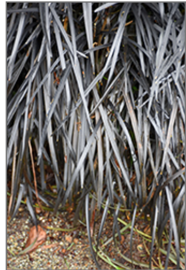
Black Mondo Grass foliage

Black Mondo Grass is a fine choice for the garden, but it is also a good selection for planting in outdoor pots and containers. It is often used as a 'filler' in the 'spiller-thriller-filler' container combination, providing a mass of flowers and foliage against which the thriller plants stand out. Note that when growing plants in outdoor containers and baskets, they may require more frequent waterings than they would in the yard or garden.