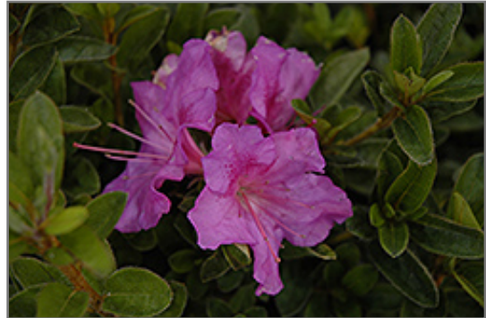
Encore Autumn Royalty Azalea flowers

Encore Autumn Royalty Azalea will grow to be about 4 feet tall at maturity, with a spread of 4 feet. It tends to be a little leggy, with a typical clearance of 1 foot from the ground. It grows at a slow rate, and under ideal conditions can be expected to live for 40 years or more.