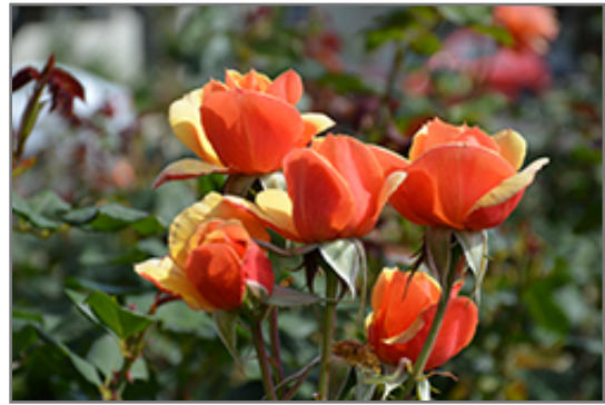
About Face Rose flowers

About Face Rose will grow to be about 6 feet tall at maturity, with a spread of 5 feet. It tends to fill out right to the ground and therefore doesn't necessarily require facer plants in front, and is suitable for planting under power lines. It grows at a medium rate, and under ideal conditions can be expected to live for approximately 20 years.