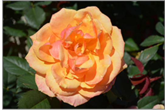
About Face Rose flowers