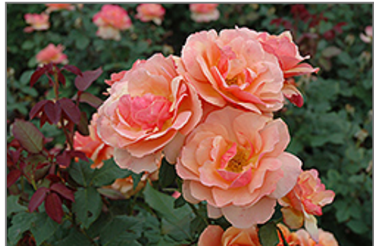
About Face Rose flowers