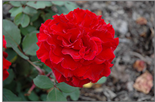
Love's Promise Rose flowers