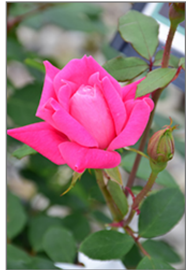
Pink Double Knock Out Rose flowers