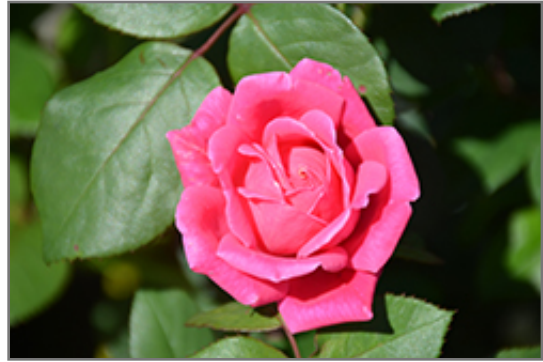
Pink Double Knock Out Rose flowers

Pink Double Knock Out Rose is recommended for the following landscape applications;