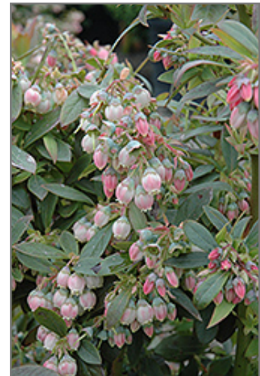
Sunshine Blue Blueberry flowers