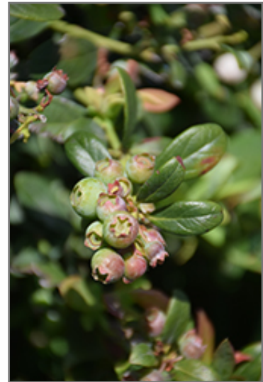
Sunshine Blue Blueberry fruit

Sunshine Blue Blueberry is a multi-stemmed deciduous shrub with an upright spreading habit of growth. Its average texture blends into the landscape, but can be balanced by one or two finer or coarser trees or shrubs for an effective composition.