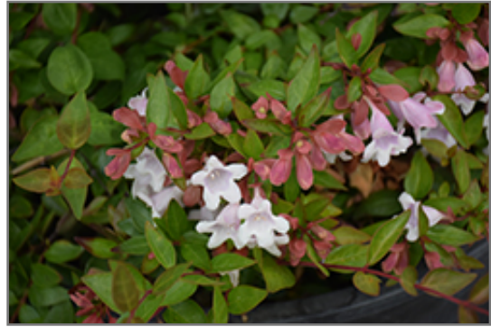
Edward Goucher Abelia flowers

Edward Goucher Abelia is recommended for the following landscape applications;