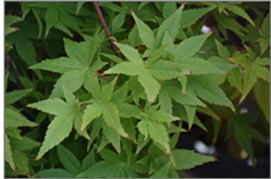
Ryusen Japanese Maple foliage