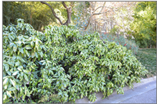
Picturata Aucuba