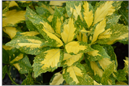
Picturata Aucuba foliage