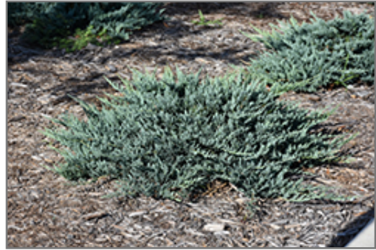
Blue Chip Juniper