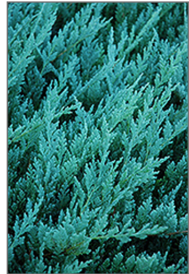
Blue Chip Juniper foliage