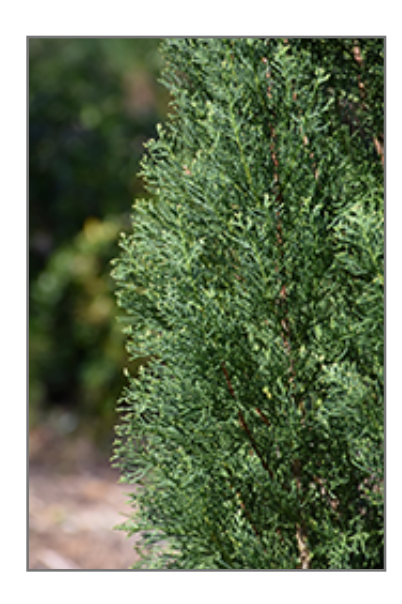
Blue Italian Cypress foliage