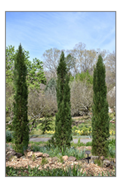
Blue Italian Cypress