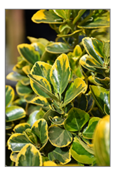
Gold Variegated Japanese Euonymus foliage