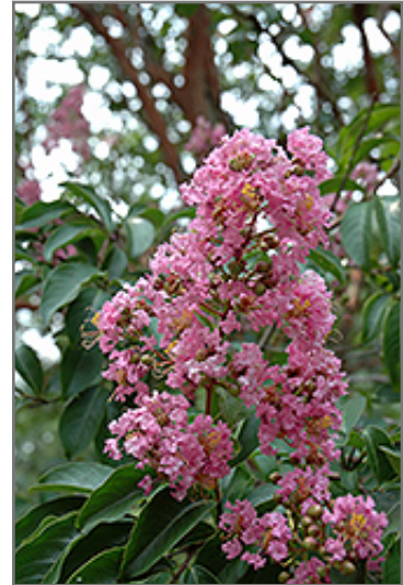
Biloxi Crapemyrtle flowers