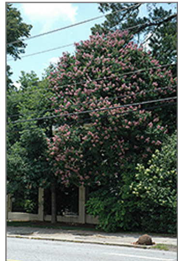
Biloxi Crapemyrtle in bloom