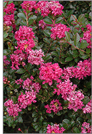
Pocomoke Crapemyrtle flowers

Pocomoke Crapemyrtle is recommended for the following landscape applications;