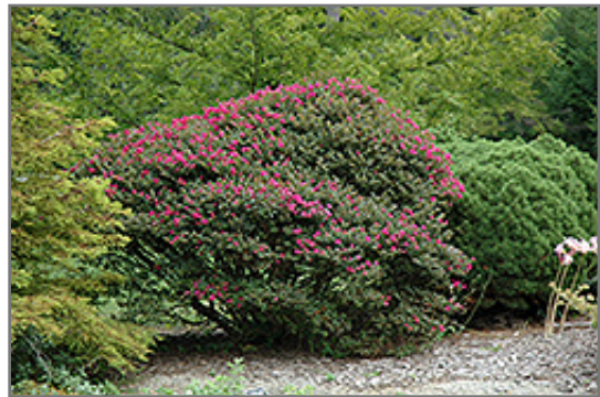
Pocomoke Crapemyrtle in bloom