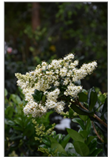
Japanese Privet flowers